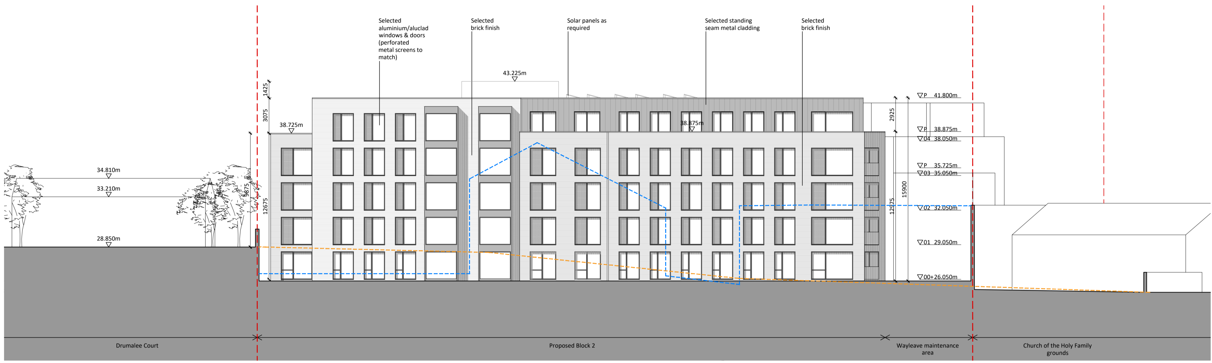
Elevation 4 - West